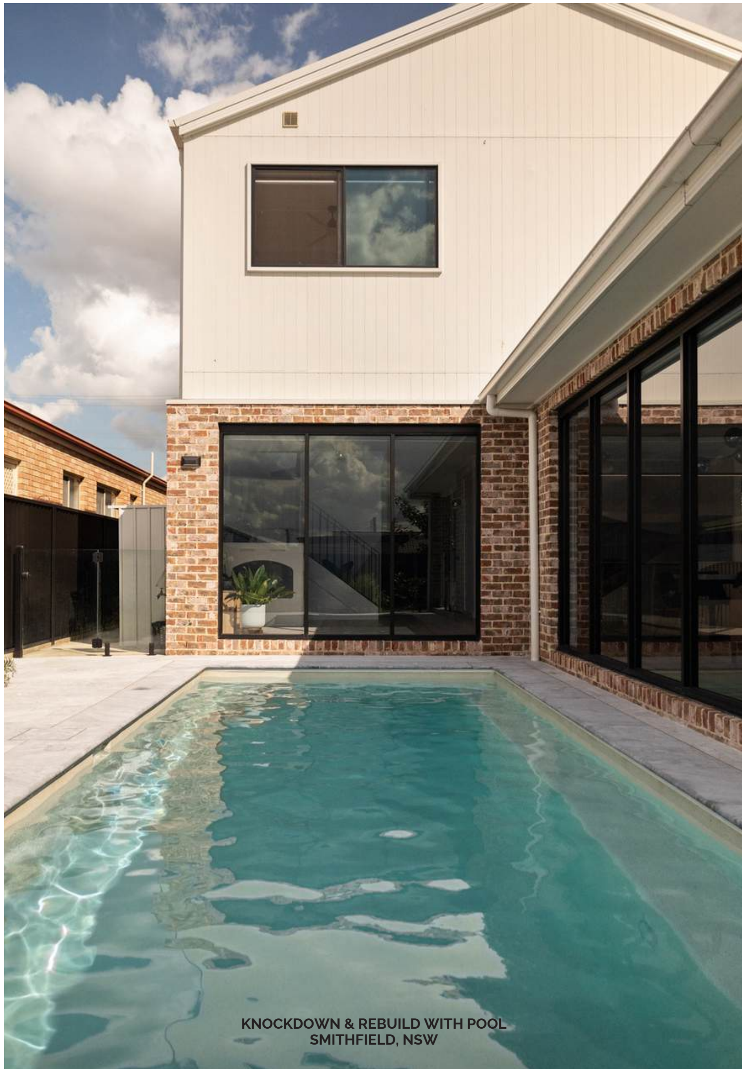
KNOCKDOWN & REBUILD WITH POOL SMITHFIELD, NSW